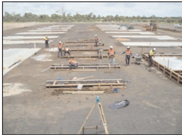
CONCRETE SLABS FOR POWER STATION — MORANBAH NORTH