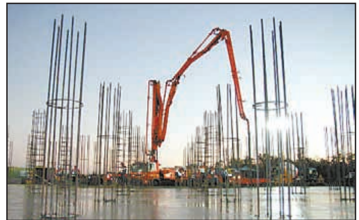
CONCRETE POUR — AMMONIUM NITRATE PLANT, MORANBAH

This work involved the full civil construction of a 45 mega watt seam gas powerstation. Works included cut to fill & imported fill for the road construction and pavement. Other works were 2 x dam constructions including HDPE Liner, drainage structures and gully pits, sediment traps, pump out pits, spoon drains, sediment ponds and underground drainage. Concrete structures included 15 engine bases; a 250m 2 gas conditioning pad; various pedestals/plinths; bulk oil pads and transformer pads; and full workshop construction including all electrical & plumbing works. Also included were 900 lineal metres of security fencing & Armcorail. Approximately 1000m 3 of concrete was used on this job.